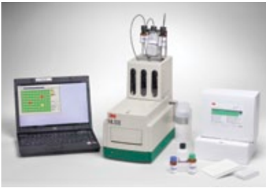
3M™ Microbial Luminescence System II (MLS II)